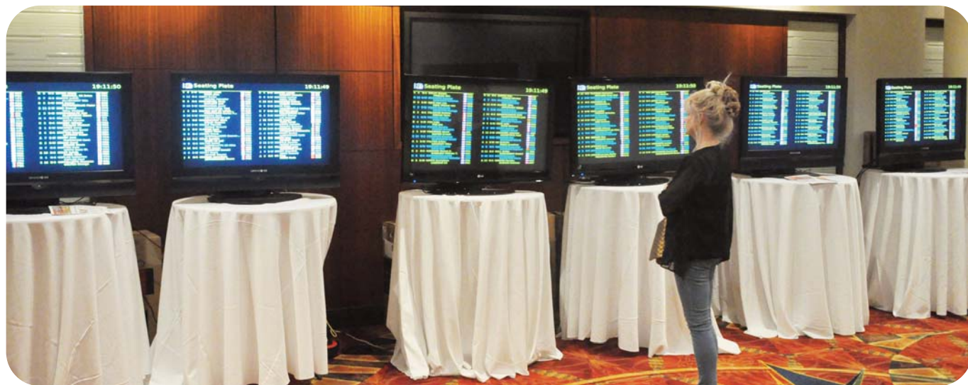
Current scores are on view on screens in the playing area