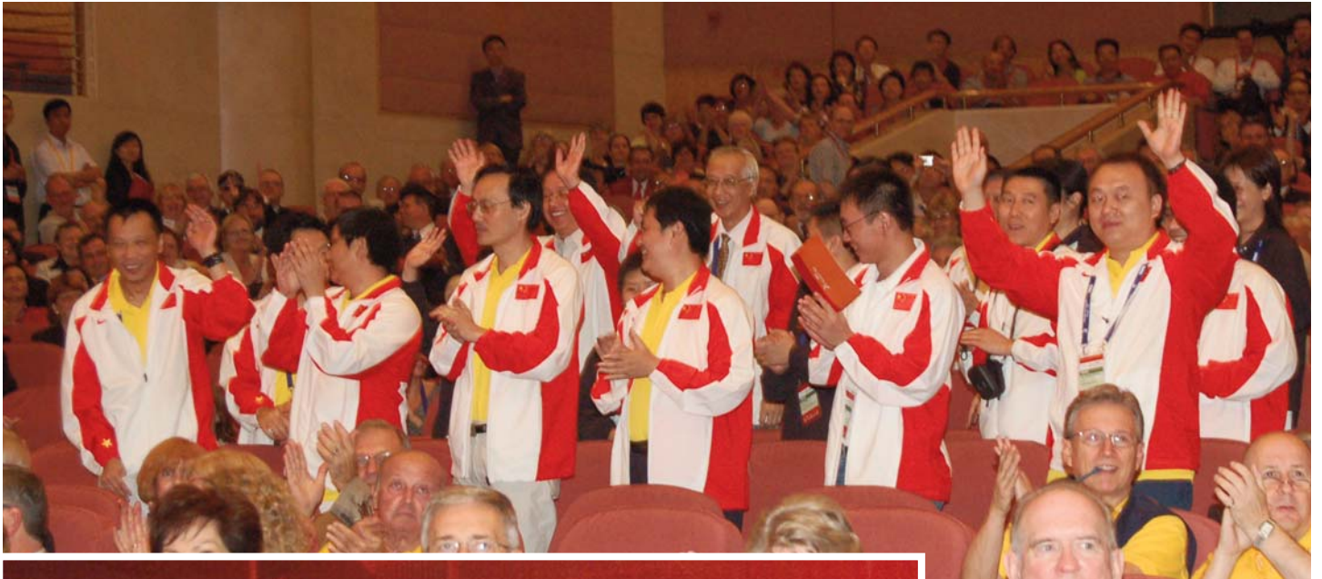
Top The Chinese team enjoy an ovation after being introduced