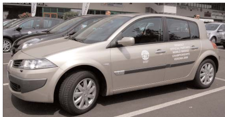
A Megane, one of the cars provided by Renault, a tournament sponsor

Lest you think it was easy to bid a grand slam on this deal I will add that it was missed 50% of the time in the McConnell.