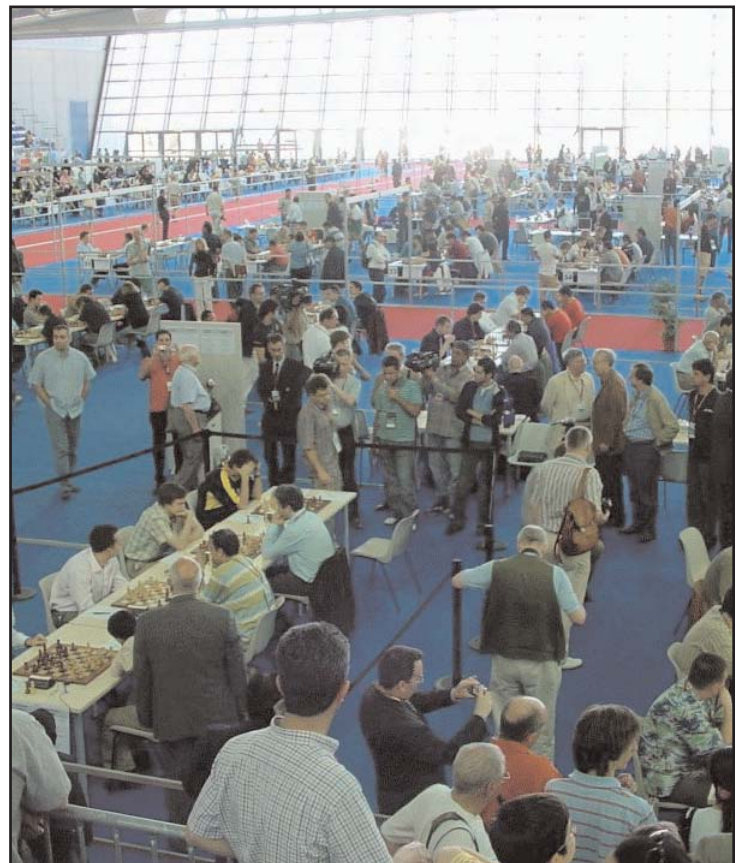
The playing area in Turin

However you view these two mighty mind sports, the first occasion on which they run side by side is certain to be one to remember.