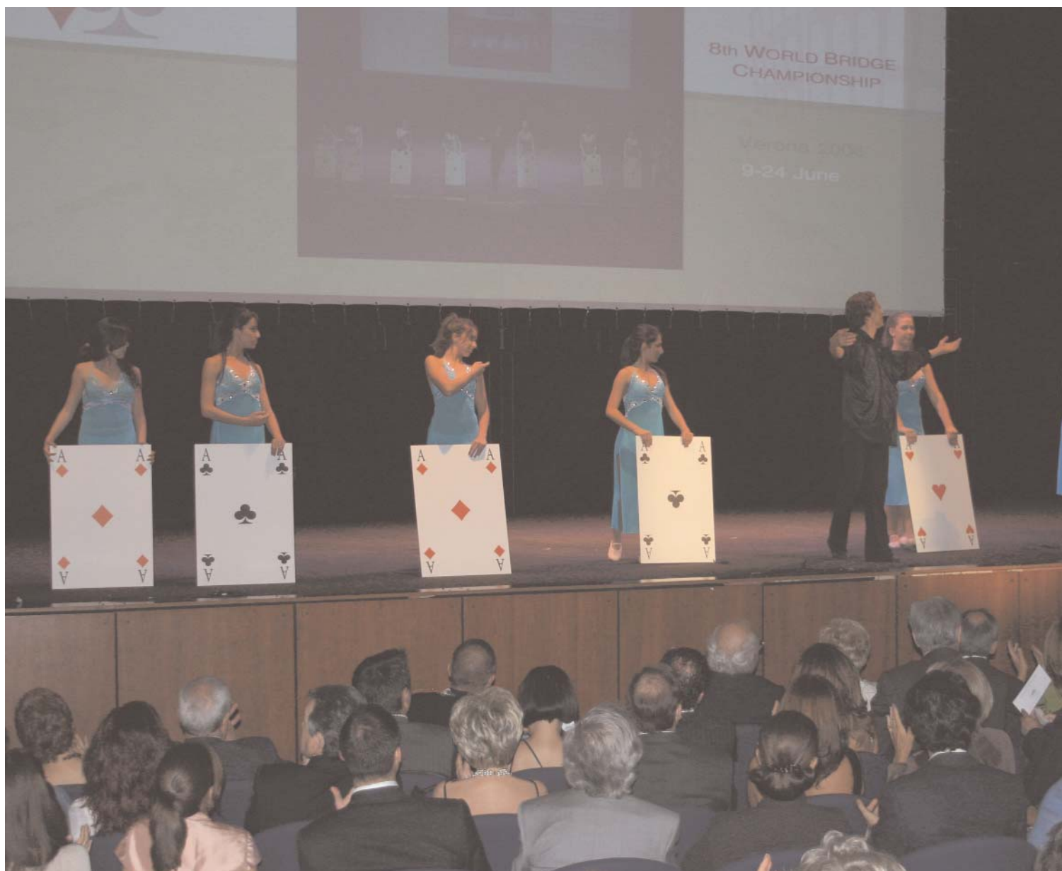
It was all aces at the opening ceremony on Friday night for the 8th World Bridge Championships

Several people have arrived in Verona sans luggage. It reminded me of the unlucky administrator who flew from Greece to Canada via France. It was a case of breakfast in Athens, lunch in Paris, dinner in Toronto.... and luggage in Tokyo.