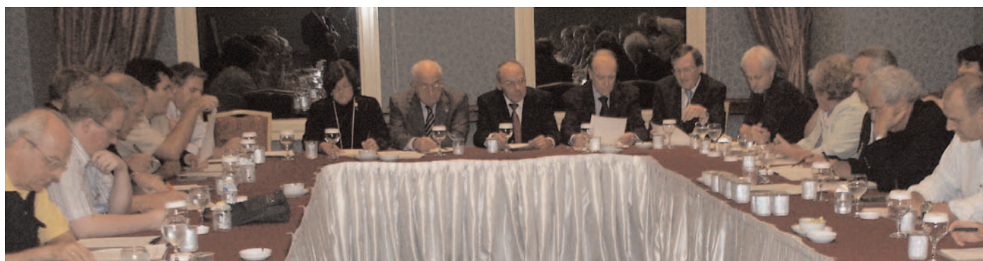
Determining the draw for the Women's round of 16.

Competition is growing more intense in the three events still running at the 12th World Bridge Olympiad.