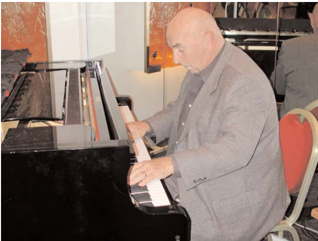
KOJAK PRACTICES THE ANTHEMS

In Victor Mollo's classic Bridge in the Menagerie, Karapet the Unlucky was always wary of Walpurgis night - what we call Halloween (in case you haven't realised that was yesterday evening). Was it the dark forces that are supposed to prevail on the night of 31 October that caused Italy to lose to Norway in what was surely one of the most dramatic matches in the history of the Bermuda Bowl?