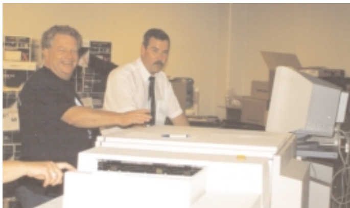
You want how many copies?