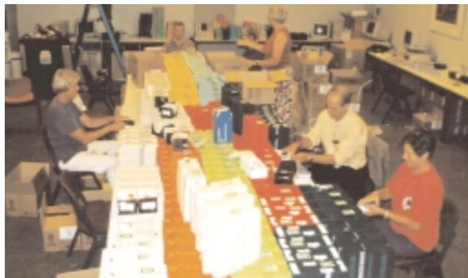
I'm missing the queen of spades