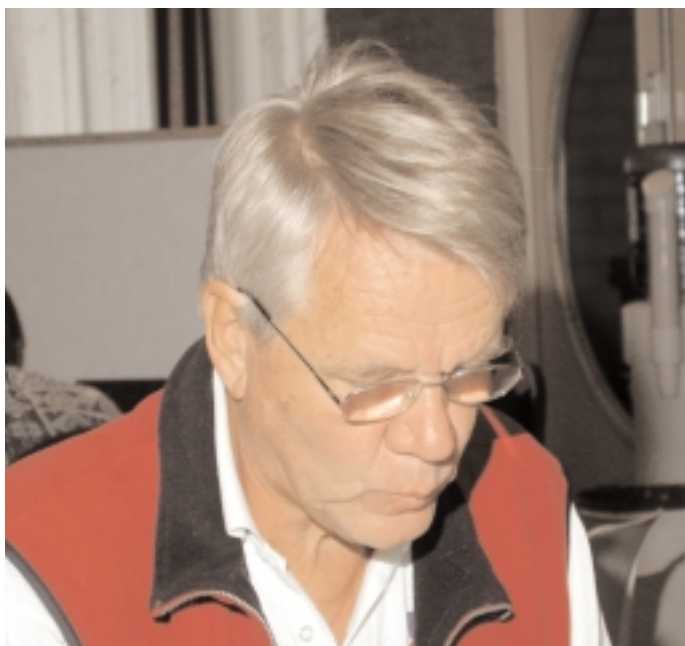
Sakari Stubb, Finland

Thomson did the best he could, ruffing a diamond in dummy and pressing on with hearts, hoping to weaken West's trumps. Kiema ruffed and got out with a spade. Thomson played the ace and continued with hearts. Kiema ruffed the heart continuation and played a club to the king and ace. Koistinen cashed the \diamond A and the \clubsuit Q , the continued with diamonds, allowing the defenders to take the \spadesuit K and \spadesuit Q separately for down five. That was 1100, and 14 IMPs to Finland, now in front, 53-29.