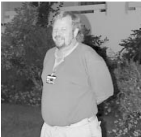
Photograph courtesy of Kodak's new digital camera

A great session had come to an end. At the half-way point in the final of the Bermuda Bowl, France led by 166-150 IMPs.