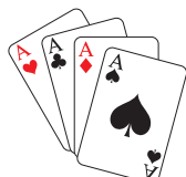
Board 99. E/W Vul. Dealer South.