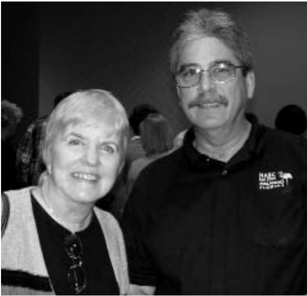
Janet Kay and Ray Wise