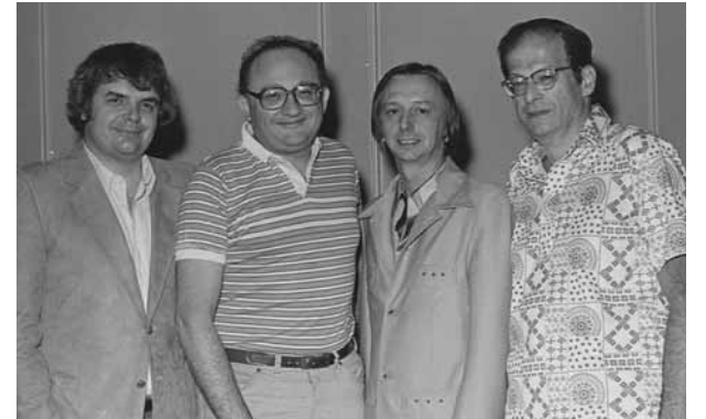
Bob Hamman, Bobby Wolff, Fred Hamilton and Ira Rubin won the 1979 Spingold Knockout Teams.