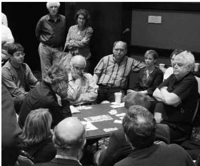
Kibitzers surround the table where the Nickell team and the Kleinplatz team faced off in the Vanderbilt Monday night.