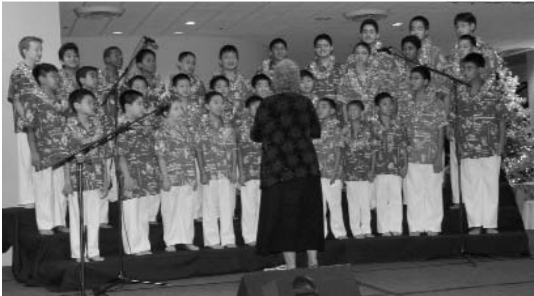
The Boy Choir of Honolulu performed yesterday between sessions.