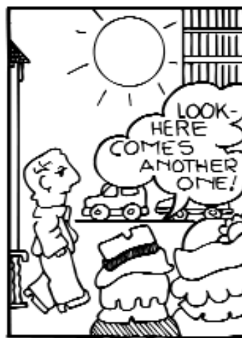
This cartoon is from Jude Goodwin's new book, "Go Ahead, Laugh", published by Master Point Press. The book is available from bridge suppliers and major bookstores.

West North East South 3♥ 3♠ 4♥ ? South is probably tempted to bid 5♦, but that contract is doomed to fail. The winning call is 4♠, but how could South know that? Alternatively, South could double 4♥, which goes down two. East-West would lose 500 points,